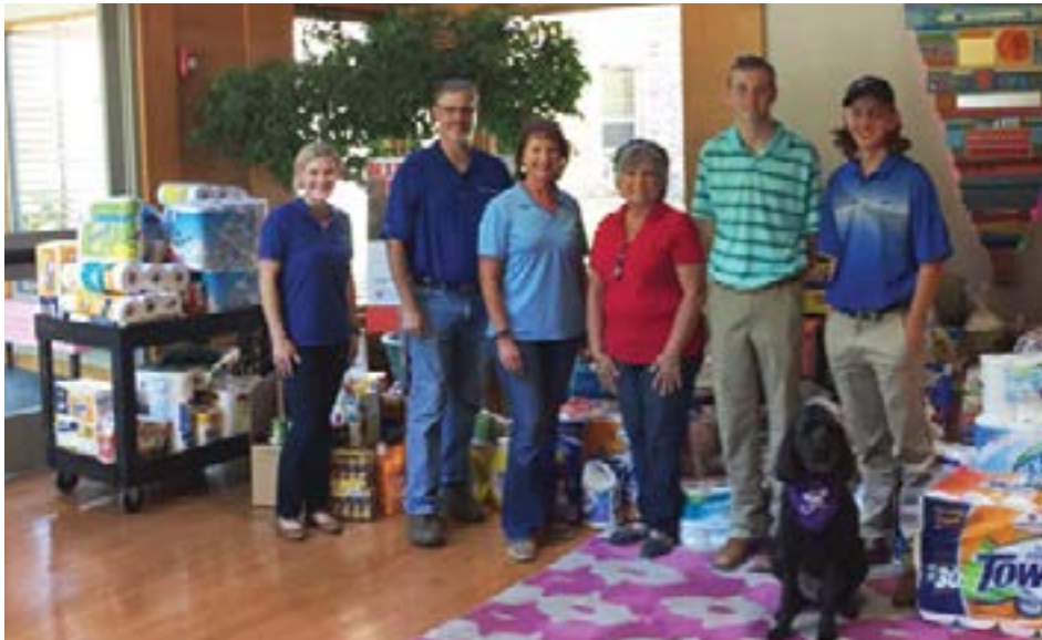
Ronald McDonald House of Fort Worth Annual Report 2016