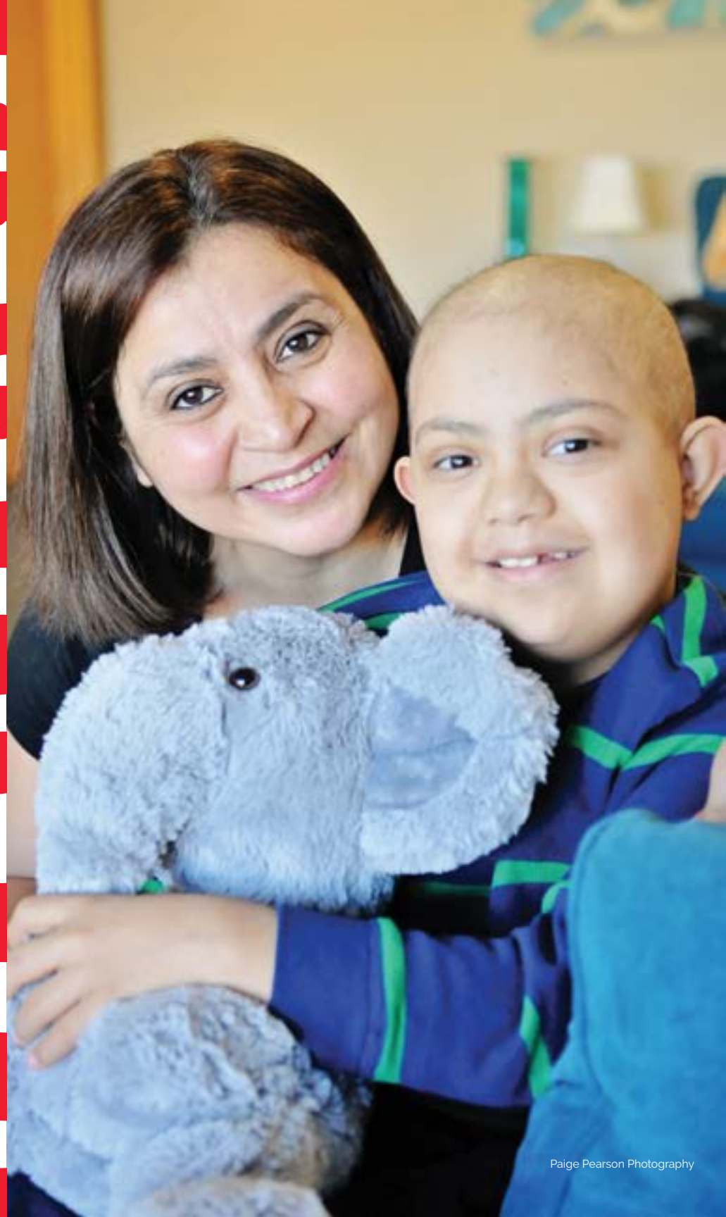
Paige Pearson Photography